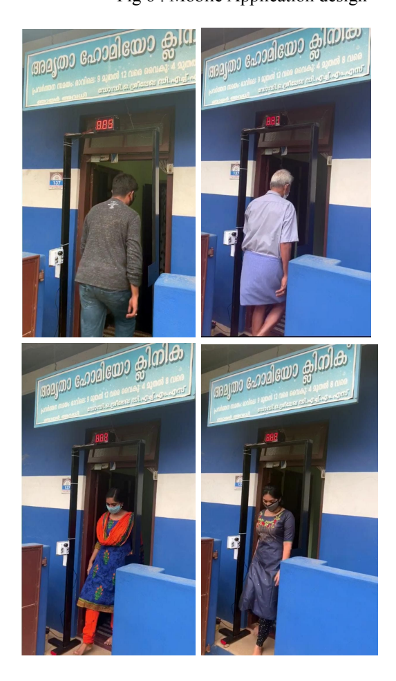
Fig 7: Live Testing [18]