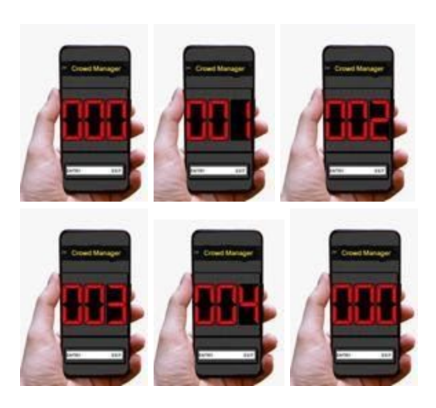
Fig 6: Mobile Application design